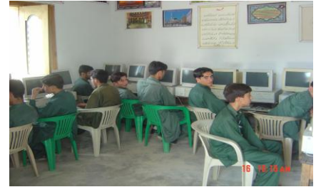
Support Computer literacy program for poor in Earthquake affected Areas - £20*

(*This amount allows us to setup Laboratory with 10 Computers - donated by Schools, Collages, & Universities in UK)