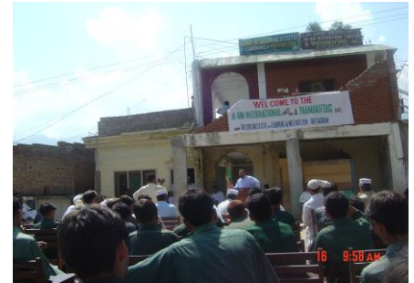
Help Educate Orphan Child in Earthquake affected Areas for a year - £30

Zakah £ _____ Sadaqah / Lillah £ _____ Total Enclosed £ _____